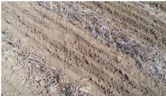
Fig.4. Field sowed by advanced seeder for row crop after a single tillage in the autumn with strip till machine.