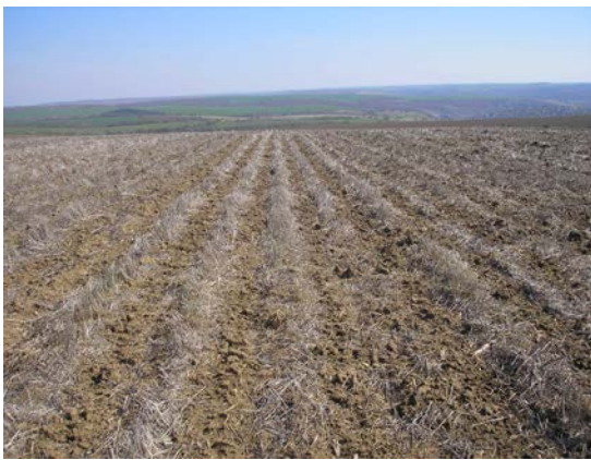
Fig.3. Field, treated with strip till machine and not tilled before sowing

A coefficient of variation is used as a criterion for estimating the levelling of the strip tilled. The results from the experiment, conducted in the same soil canal, show that after the treatment of the cultivator section, the profile of the 10 m strip is with a coefficient of variation 6,2 %. The value obtained is smaller than 7 %, allowed when the levelling of the field surface after the treatment [3].